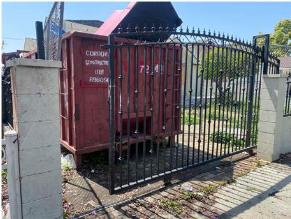
Frontyard: 5812 Lexington Ave., April 2021