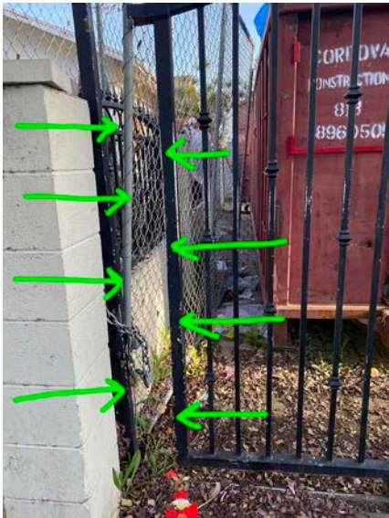
Frontyard: 5806 & 5812 Lexington Ave., Google street view of how it used to look.